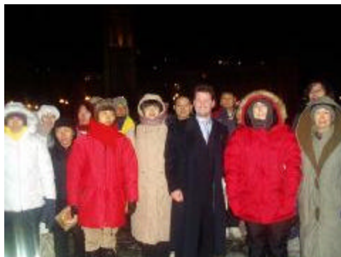
MP Reid poses for a group photo with practitioners

After the meeting was over, MP Reid came to meet Falun Gong practitioners in the cold winter night, gave a speech and had a group photo with practitioners.