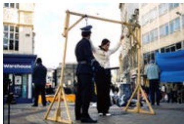
Torture Methods Demo

Around 1700 signatures were gathered that day, revealing the kind-hearted support of the Liverpool people.