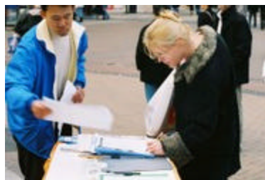
A lady signs a petition. About 1,700 people signed the petition during the event