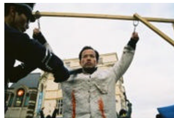
Torture Methods Demo