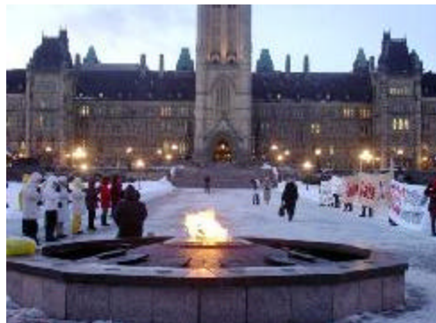
Falun Gong practitioners in Canada appeal before the annual meeting of the United Nations Human Rights Commission

As the annual meeting of United Nations Human Rights Commission in Geneva approaches, the persecution of Falun Gong has caught the attention of the international community again. On the evening of March 9, 2005, Falun Gong practitioners in Canada gathered in front of the Canadian Parliament in the below 20°C cold and called on the Canadian Government to take responsibility for respecting and protecting human rights and condemn the Chinese Communist Party for trampling the basic human rights of Falun Gong practitioners.