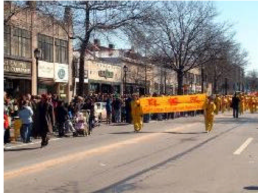
The Falun Gong procession in the parade

On March 12, a large-scale parade for St. Patrick's Day took place in White Plains, New York. Groups from different ethnic communities participated in the event. Last year, Falun Gong practitioners' performance was well received and they were invited again this year. The organizers also provided free parking for Falun Gong practitioners this time.