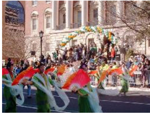
Celestial Maiden dancers pass the stage

The Waist Drum team of the Greater New York Area has participated in many large events. The procession marched in good order, and the bright yellow exercise suits worn by the practitioners were made a beautiful contrast against the blue sky. The "Celestial Maidens" danced in the chilly weather with soft fans, displaying the purity of cultivation practice.