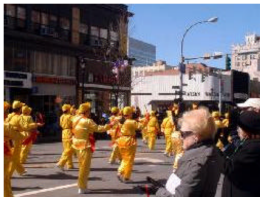
Spectators wave to Falun Gong Practitioners

St. Patrick's Day was created to commemorate the Christian missionary St. Patrick, who brought the Gospel to Ireland in 432. He died on March 17, 493, so the Irish people made this day a holiday to commemorate him. The United States began to celebrate St. Patrick's Day in 1737. Usually there will be a parade, church activities and a community dinner party.